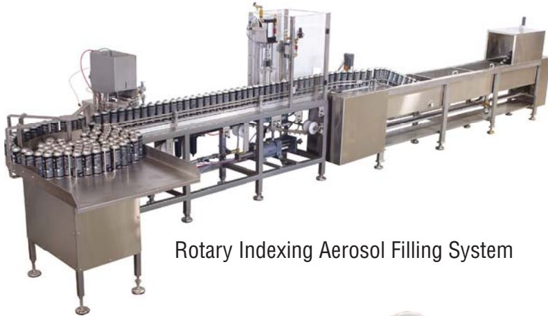
Rotary Indexing Aerosol Filling System

Monoblock, rotary indexing design suitable for aerosol products with flammable or non-flammable liquified propellants and CO2 impact charging.